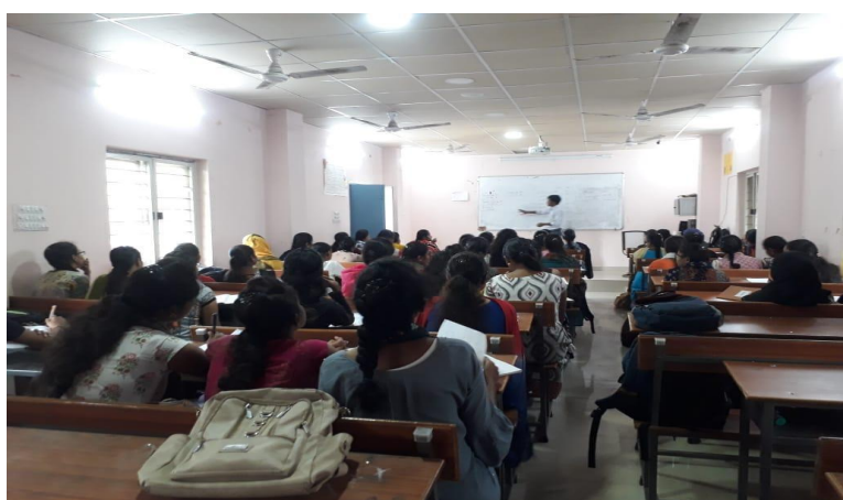
Topic: Tally Class Objective: Computerised Tally Learning