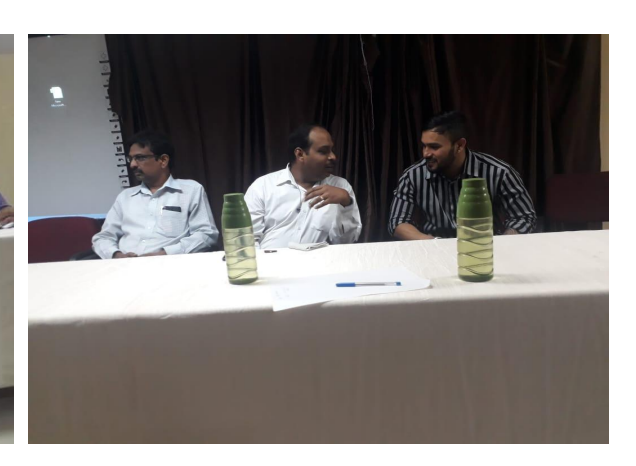
Topic: Tally Uses & Scope